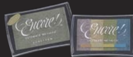
Encore Ultimate Metallic Single and Multi-Color Inkpad 3.75" x 2.5" (95 x 60 mm)