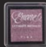
Encore Ultimate Metallic Small Inkpad 1.25" x 1.25" (33 x 33 mm)