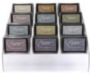
Encore Full Size Pad 36 pc Display Set 3 each of 12 colors 13" w x 12" d x 6.75" h (330 x 305 x 172 mm)