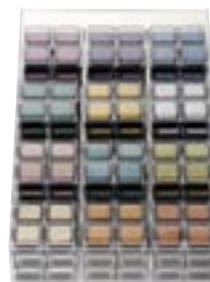
Encore Small Pad 144 pc Display Set 12 each of 12 colors 9" w x 12.5" d x 5.75" h (229 x 318 x 146 mm)